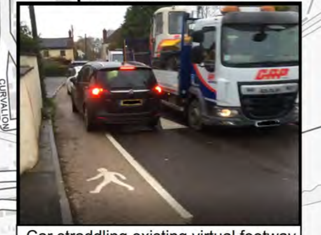
Car straddling existing virtual footway to avoid HGV