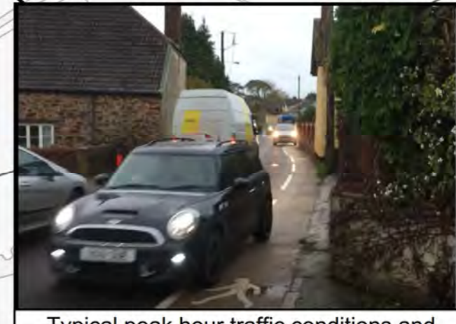
Typical peak hour traffic conditions and neglect of virtual footway by motorists