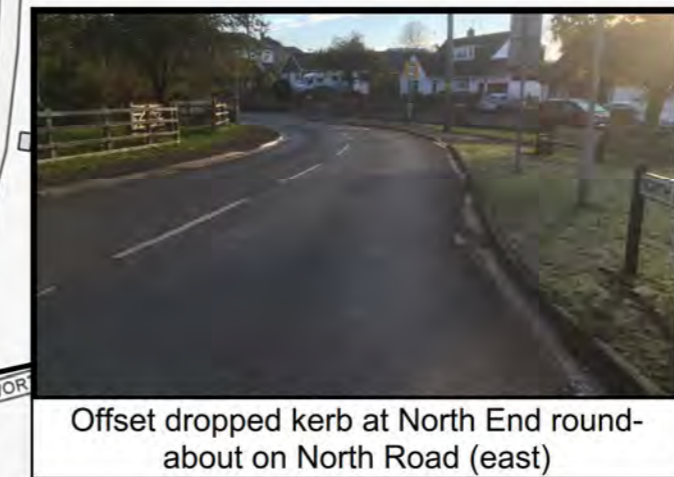
Offset dropped kerb at North End roundabout on North Road (east)