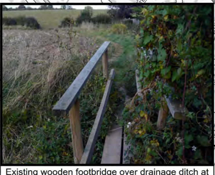
Existing wooden footbridge over drainage ditch at PRoW T-10/23