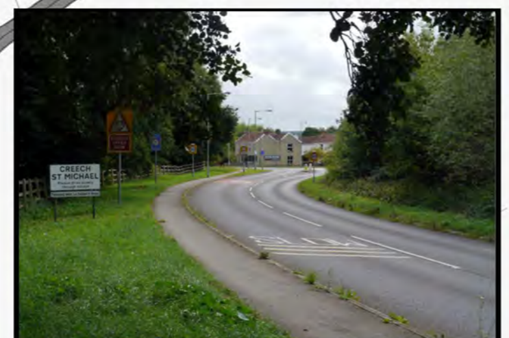
Existing traffic calming on Langaller Lane