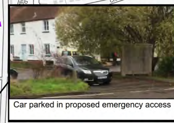
Car parked in proposed emergency access