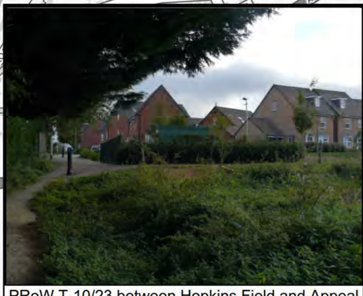
PRoW T-10/23 between Hopkins Field and Appeal Site