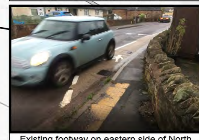
Existing footway on eastern side of North End up to Dunklins House