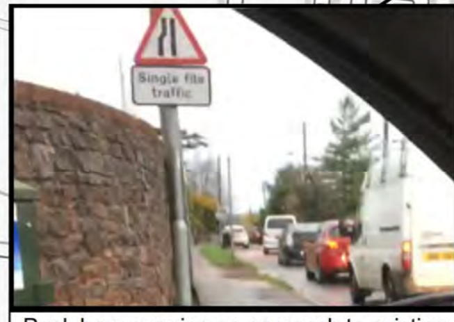
Peak hour queuing on approach to existing priority working