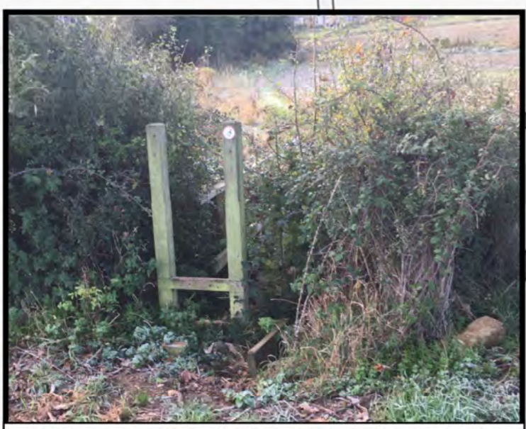
Existing wooden footbridge over drainage ditch at PRoW T-10/23 and T-10/24