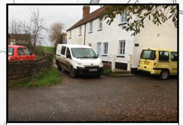
Van parked in PRoW T-10/24 (proposed emergency access)