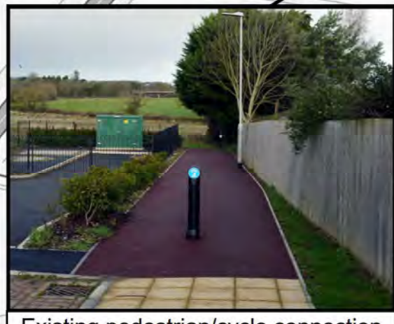
Existing pedestrian/cycle connection to Hopkins Field PRoW T-10/23